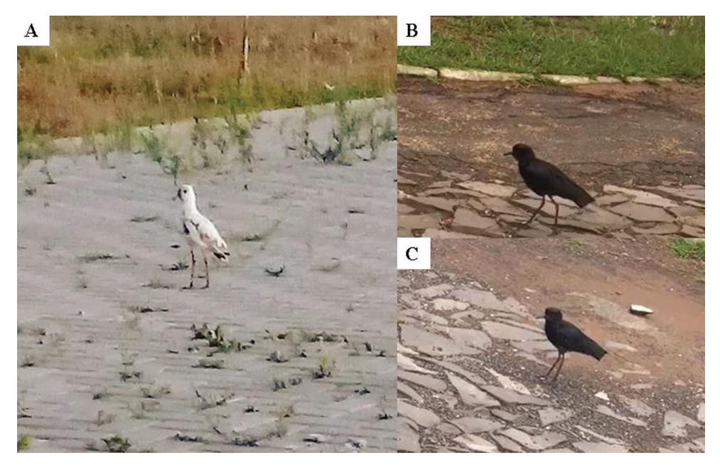
Figure 1. Individuals of Southern Lapwing ( Vanellus chilensis ): ( A ) with progressive greying; ( B , C ) with melanism.

sarily correct (van Grouw 2017). In case of melanism the coloration of both feathers and skin will depend on the concentrations of these pigments in the feather formations (van Grouw et al. 2011; van Grouw and Nolazco 2012; van Grouw 2017). In some cases, pigmentation levels may not increase sufficiently to make the bird completely black, including some cases leading to lighter colorations than the normal pattern of the species (van Grouw et al. 2011; van Grouw 2017).