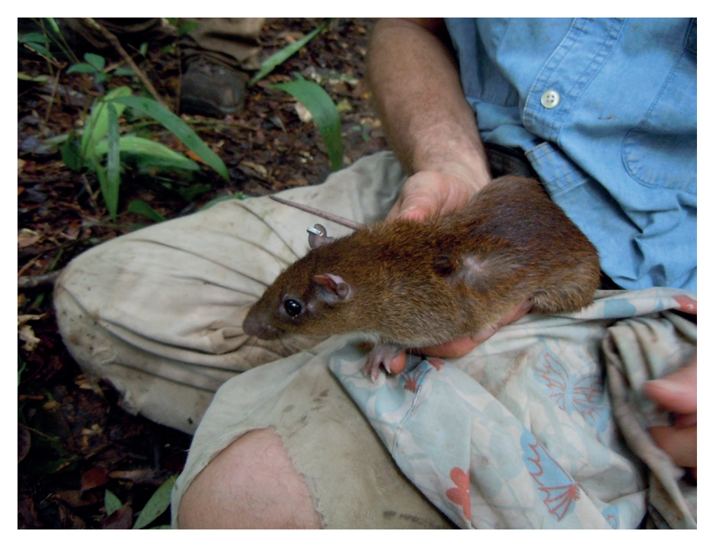
Figure 2. Adult Proechimys semispinosus from the study site.

(Tomblin and Adler 1998). This strictly-terrestrial echimyid rodent consumes a wide variety of fruits and seeds, including those of A. butyracea (Adler 1995). It also frequently scatter hoards large seeds (Hoch and Adler 1997; Adler and Kestell 1998; Carvajal and Adler 2008; Kilgore et al. 2010; Dittel et al. 2015).