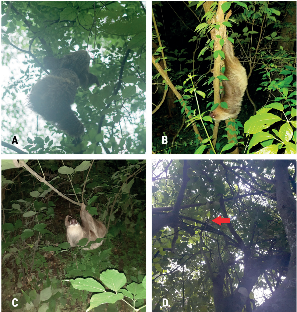
Figure 3. Images showing relevant events of the two-toed sloth release and follow-up. (A) Bravo, the two-toed sloth moving through the trees on the day of release with a biodegradable backpack that supported the Bluetooth detection device (Day 1). (B) Motionless defensive behavior of Bravo, the two-toed sloth, under threat from an owl (Night 6). (C) Movement during ground feeding behavior. (D) Example of low detectability of the two-toed sloth during search (Day 10).

conditions (Fig. 2B). In addition, the studied sloth was always found sleeping at 18:00, so it was easier to spot due to the previous night's monitoring observations and the daylight condition. Relative analysis between number of monitoring days and visibility showed consistency with the raw data (Fig. 1B). Alternatively, heavy downpours in the rainy season could affect the visibility and possibility to persist in the area, but in our study we could remain near the two-toed sloth during monitoring and the number of detections was not affected. Only an electric storm during