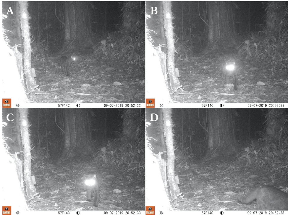
Figure 2. First records of melanistic oncilla ( Leopardus tigrinus ) for Monteverde, Costa Rica.

melanism was not randomly distributed, was absent in open habitats and was related to climatic variables (humidity).