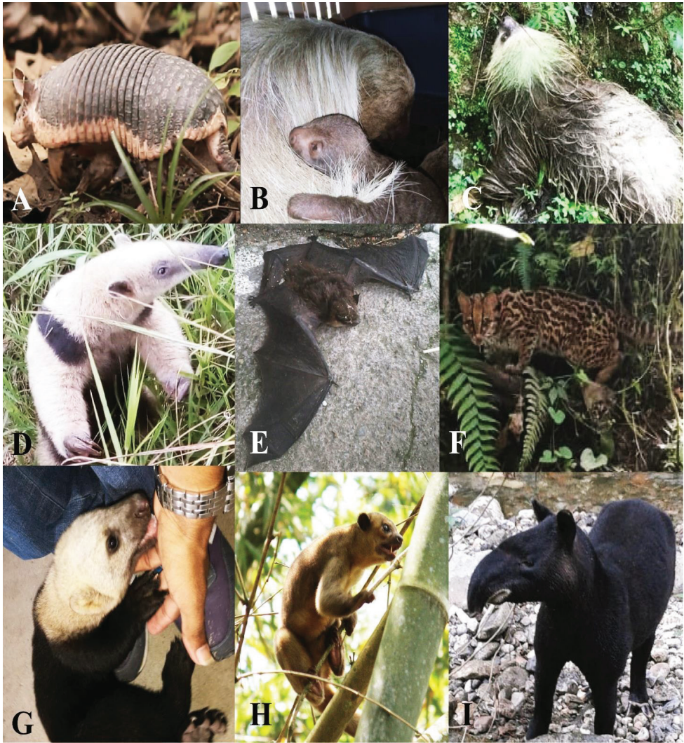
Figure 3. Alive specimens photographed by the local people between 2017 and 2019 in private areas located on the Central Cordillera of Colombia. A. Cabassous centralis , B. An adult female and a juvenile of Choloepus hoffmanni , C. Adult Choloepus hoffmanni , D. Tamandua mexicana , E. Eptesicus fuscus miradorensis , F. Leopardus wiedii , G. Eira barbara , H. Potos flavus , I. Tapirus pinchaque .