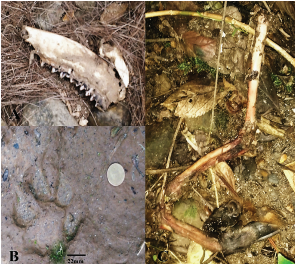
Figure 4. Signs of a Dwarf Red Brocket Deer ( Mazama rufina ) killed by a cougar ( Puma concolor ) in Bosques de la CHEC, Central Cordillera of Colombia, found on August 2 nd , 2019 by H. Ramírez-Chaves. A. Mandible of the red brocket deer, B. Footprint of the cougar, C. Front leg of the deer. Deer's remains were deposited in the mammal's collection as MHN-UCa-M 2777.

description of the species (Díaz-N. et al. 2011; Díaz-Nieto and Voss 2016), such as the number of antebrachial vibrissae, with two instead of one. However, the specimen exhibited most of the diagnostic characters, such as the absence of cuspids on its upper incisors and the connections of the pads of the left hind foot (Díaz-N. et al. 2011). In addition, the record of M. caucae is the first confirmed for the study area, despite the species being previously recorded in the Department of Risaralda (Castaño et al. 2017).