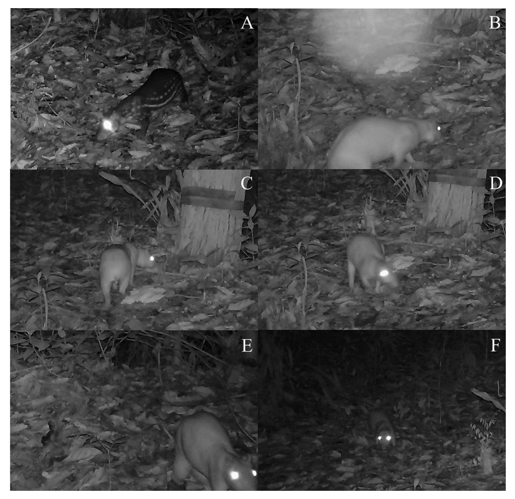
Figure 2. Photographs of a paca ( Cuniculus paca ) with normal colouration ( A ) and an albino individual in a medium subdeciduous forest in the Sierra Norte of Oaxaca, Mexico ( B-F ).