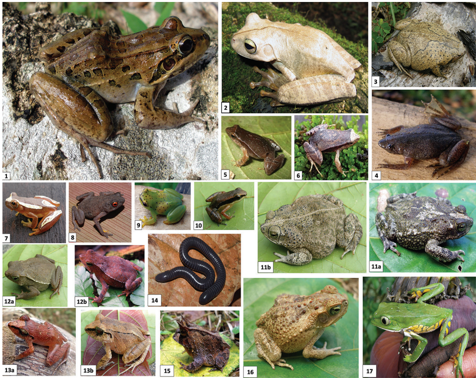
Figure 2. Amphibian photo board used during the interviews, for species recognition by the residents of the surroundings of a protected area in the Atlantic Forest, north-eastern Brazil. (1) Leptodactylus latrans ; (2) Boana faber ; (3) Stereocyclops incrassatus ; (4) Pipa carvalhoi ; (5) Physalaemus camacan ; (6) Physalaemus cf. camacan ; (7) Dendropsophus elegans ; (8) Frostius erythrophthalmus ; (9) Phyllodytes melanomystax ; (10) Allobates olfersioides ; (11) Rhinella granulosa ; (12) Rhinella hoogmoedi ; (13) Haddadus binotatus ; (14) Siphonops sp.; (15) Proceratophrys renalis ; (16) Rhinella crucifer ; (17) Phyllomedusa burmeisteri .