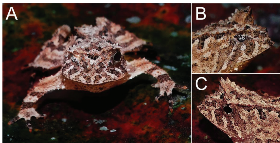
Figure 1. Juvenile of Proceratophrys schirchi with microphthalmia in the right eye. (A) Frontal sight of the individual; (B) Affected right eye; (C) Normal left eye.

The second malformed individual was a metamorphosing froglet of Crossodactylus timbuihy Pimenta et al. 2014. This anuran (MBML 11196; SVL = 11.2 mm) was collected on 17 January 2018 on a rocky outcrop close to a stream, and a careful examination exposed a case of hemimelia with ectrodactyly and brachydactyly in the left hindlimb, i.e., shortening of tibiafibula and tibia and fibula (hemimelia), only two digits (ectrodactyly), and all of them were short (brachydactyly) (Fig. 2A–D).