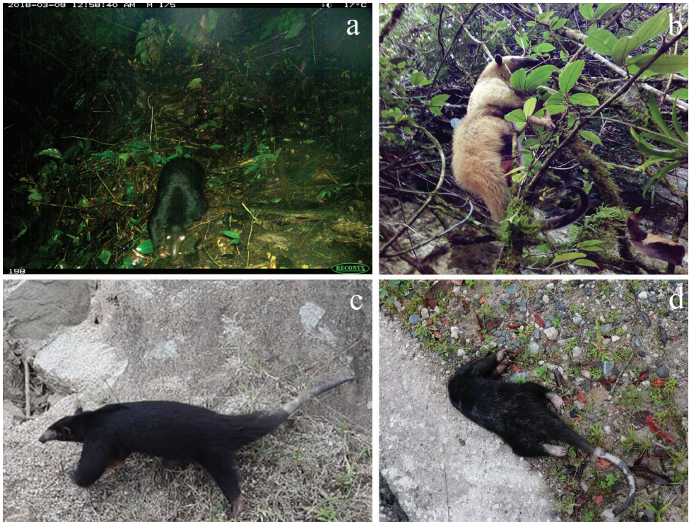
Figure 1. Tamandua tetradactyla recorded in the southern part of Podocarpus National Park, Ecuador: a) Melanistic individual recorded in a camera trap placed in the surroundings of the San Luis waterfall; b) An individual with yellowish coloration observed during the monitoring; c) Melanistic individual observed in the Loja – La Balsa E682 road; d) road-killed melanistic specimen photographed in the E45 road in Limón Indanza, Morona Santiago

was documented by a camera trap on March 9, 2018, at 00:58h. The camera was placed on a wildlife trail in a mountain forest ( 4^{\circ}32'56.36''\text{S} , 79^{\circ}3'18''\text{W} ; 1,391 m a.s.l.), in the surroundings of the San Luis waterfall, Porvenir del Carmen, Zamora Chinchipe (sampling effort 33 trap-nights) (Fig. 2). Our second record occurred during the usual patrol of the park rangers of the Podocarpus National Park. It was on October 10, 2018 at noon, at a straight-line distance of 21 km from the previous record, in the Loja – La Balsa E682 road, Zamora Chinchipe ( 4^{\circ}43'31.77''\text{S} , 79^{\circ}7'19.13''\text{W} ; 1184 m a.s.l.), which crosses wooded and disturbed areas, in a terrain characterized by steep slopes and rugged topography (Fig. 2). The third record was made by C. Jara; he took a photo of a road kill melanistic specimen in E45 road, Limón Indanza, Morona Santiago ( 4^{\circ}43'31.77''\text{S} , 79^{\circ}7'19.13''\text{W} ; 1184 m a.s.l.) on October 23, 2018, at a straight-line distance of 185 km from our camera trap record (Fig. 2).