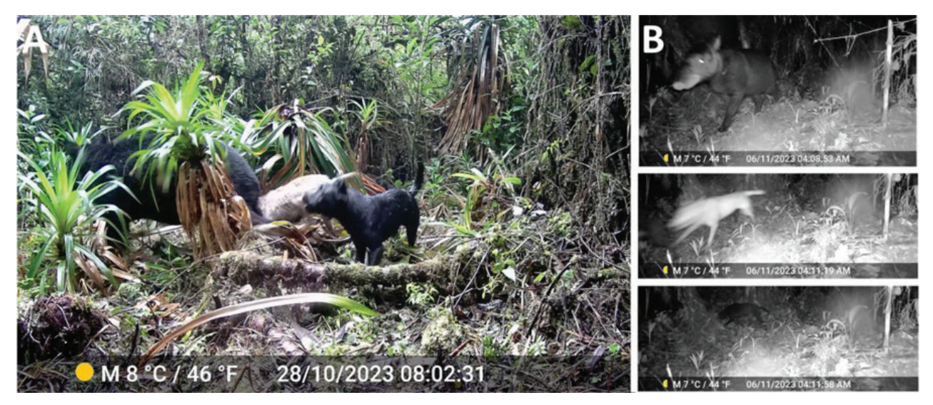
Figure 2. Photographic evidence of domestic dogs A attacking and B chasing mountain tapirs in a private protected area of the Central Andes of Colombia.

Our photographic evidence highlights the importance of using camera traps to improve our understanding of hardly detectable threats that may face imperilled species in montane landscapes with limited accessibility and difficult research conditions. A recent study in the Western Andes of Colombia did not find evidence that dog occurrence led to meaningful changes in habitat use of forest-dwelling mammal species (Bedoya-Durán et al. 2021). Our evidence suggests the opposite, where even a single pack of two or three dogs seems to pose a serious threat to a large and highly threatened mammal like the mountain tapir. There is evidence of dog attacks on mountain tapirs in the Central Andes of Ecuador (Castellanos et al. 2022), lowland tapirs (T. terrestris) in the Atlantic Forest (Lacerda et al. 2009; Lessa et al. 2016; Gatti et al. 2018), as well as guanacos (Lama guanicoe) and pudus (Pudu puda) in the Southern Andes of Chile (Silva-Rodríguez and Sieving 2012; Silva Rochefort and Root-Bernstein 2021). Other ungulate species from the area can also be at risk by staying in contact with dog populations, particularly smaller herbivores, such as dwarf red-broket deer and Northern pudu (P. mephistophiles).