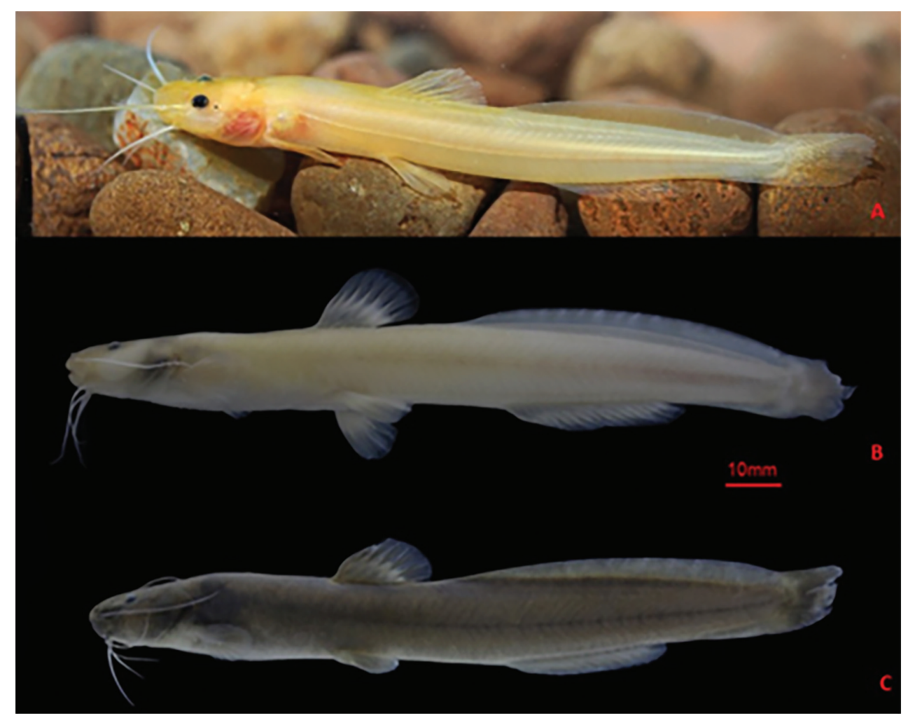
Figure 2. Lateral view of Heptapterus mustelinus from the coastal streams of the Mampituba River A leucistic individual in life (54.74 mm SL), UNICTIO 2396 B leucistic individual fixed (112.8mm SL), UNICTIO 2035-2 C Individual with regular pattern color (87.7 mm SL), UNICTIO 2395-9.

One leucistic individual was an adult with 112.8 mm SL, and three were juveniles with a mean SL of 62.5 mm (SD = 15.20). The results of the PC2 and PC3 axis show that the leucistic individuals fit into the general H. mustelinus measurement pattern (Fig. 3). PCA showed additionally that the fish were grouped by species pattern measurement, and that the populations of the Mampituba River encompass all groups.